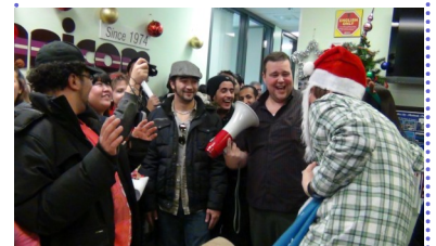
Santa made some time for Omnicom.