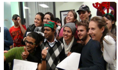
Picture perfect smile at Christmas party.

Like us www.facebook.com/omnicomstudyTO Follow us www.twitter.com/omnicomstudyTO Join us http://www.linkedin.com/company/omnicom-school-of-languages-toronto- See us http://www.youtube.com/user/OmnicomTO/videos